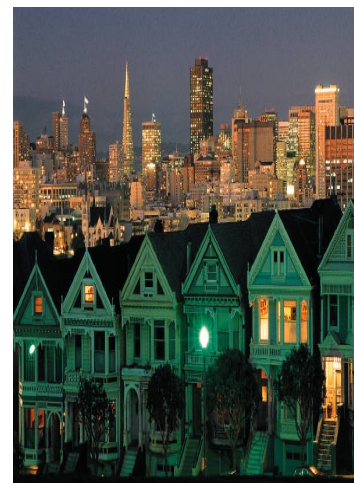
San Francisco, California