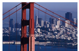
San Francisco Bridge